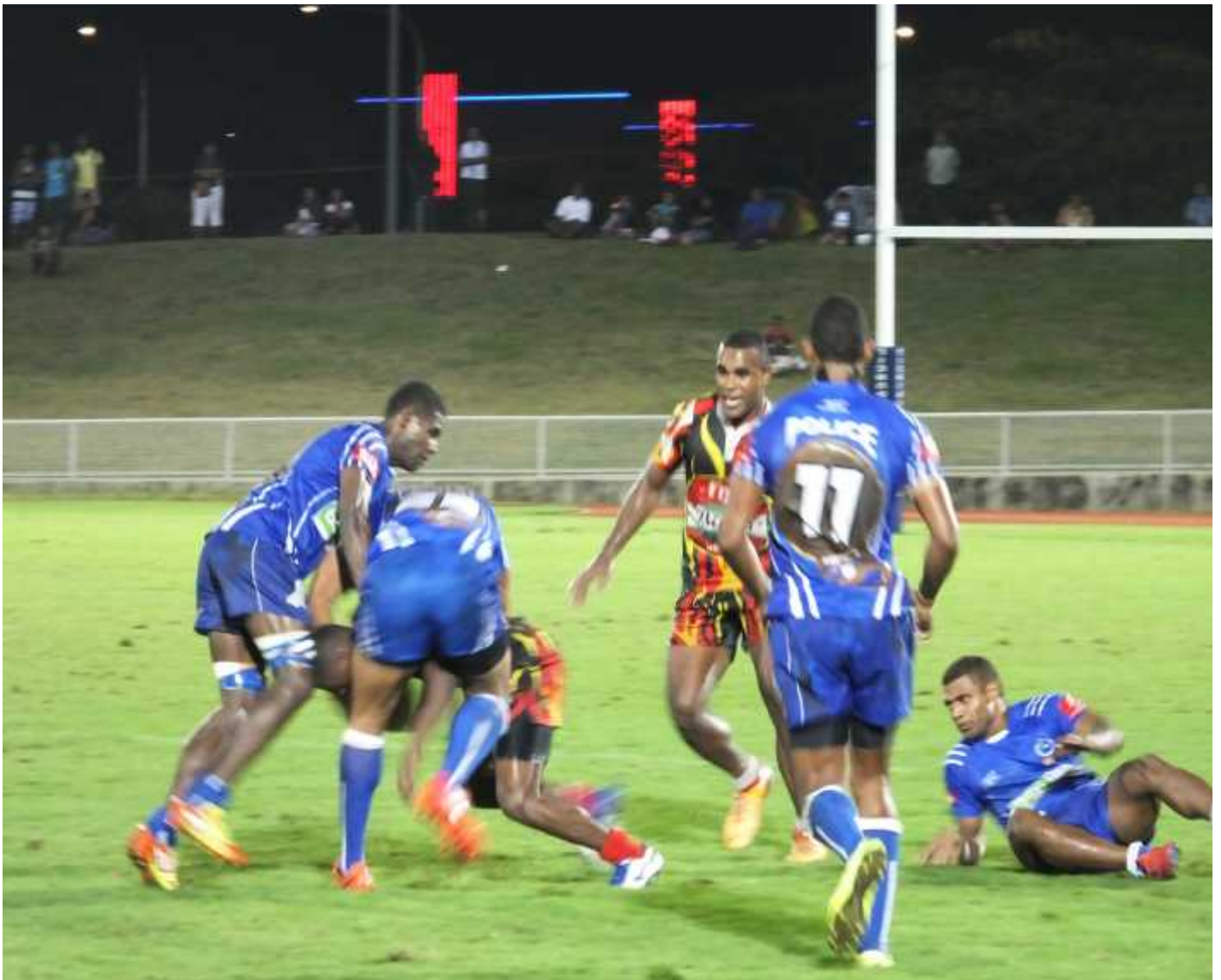
Action between Police Blues and the National Fire Authority final at the ANZ Stadium in Suva. Police Blues won 18-15.