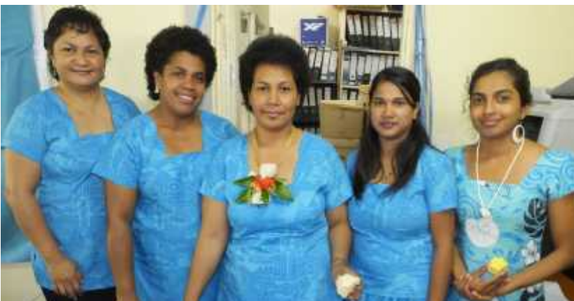
Headquarters staff in their Fiji Day attire.