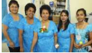
Fiji Day celebrated in style PAGE 4