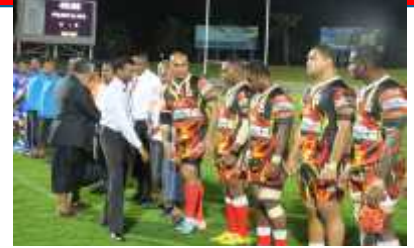
NFA reached Escott Shield final PAGE 8