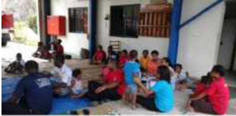
Family Funday a success PAGE 2